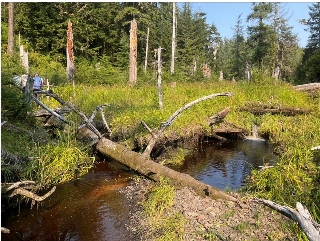
Figure 3.—Channel at waypoint 733.