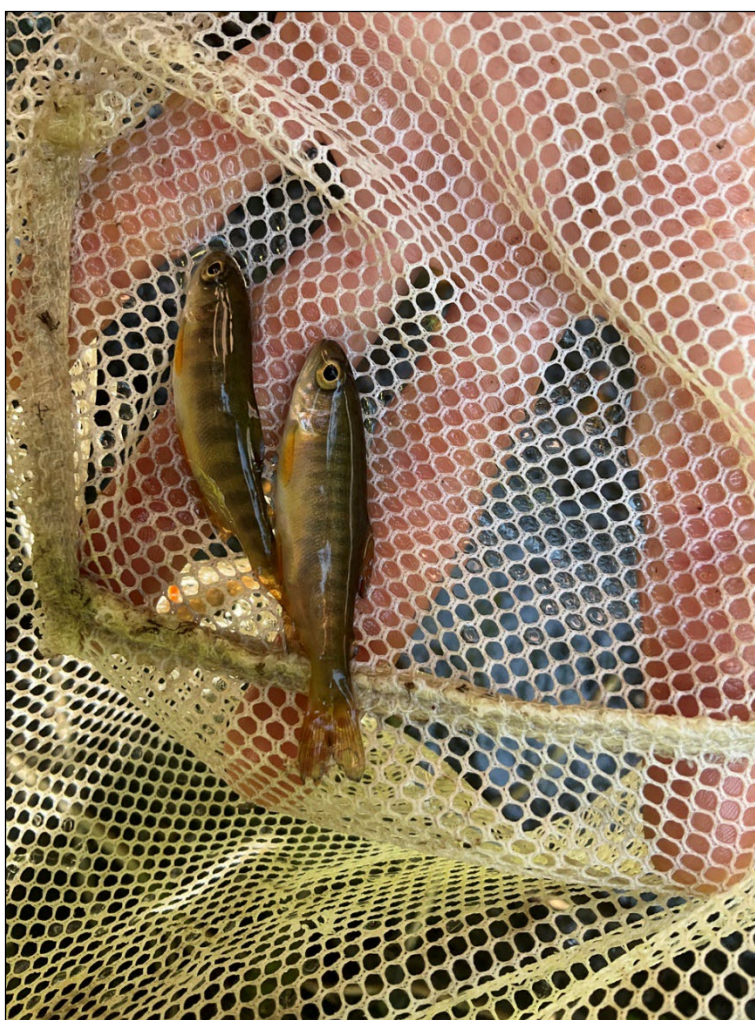
Figure 1.–Juvenile coho salmon captured at waypoint 731.