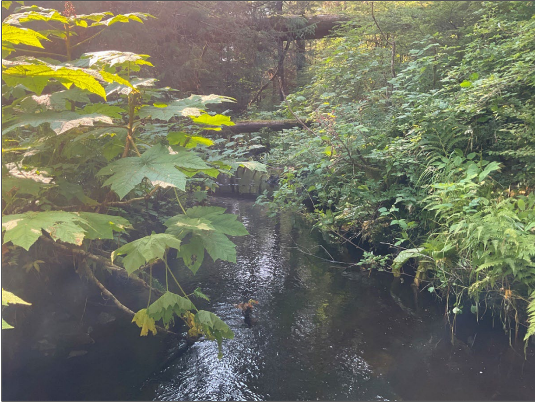
Figure 2.—Channel at waypoint 731.